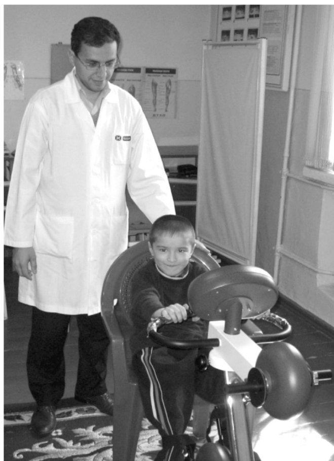
Image 1 Child is training with the MOTOMed gracile12

MOTOMed training took place in sitting position and under guidance of an experienced movement therapist ( image 1 ). During their inpatient stay of 15 to 20 days the children received an additional daily training from 10 to 25 minutes (depending on age, physical endurance, and the present limitations) on the movement therapy device.